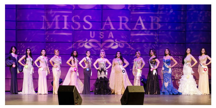
Formal Gowns - Requirements for the gown - MUST be floor length, no HIGH slits in the legs, NO super low backs, example above.